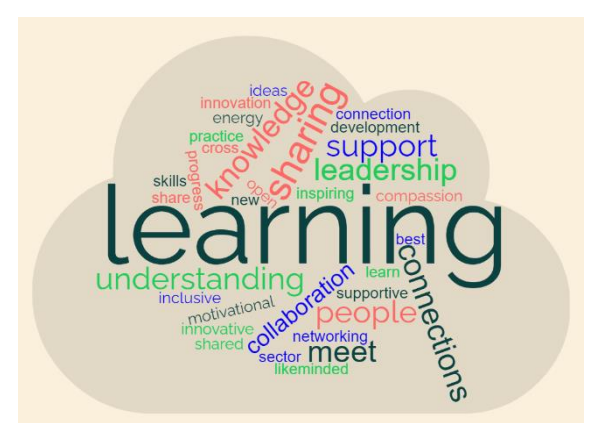
Our members' hopes for the network

The aim is to develop a network where members can be inspired, have honest and open conversations, and share emergent system leadership practice. The sessions were structured to support leaders across the regional to share learning, ideas and innovations and build on existing strengths.