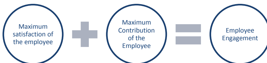
Figure 1 The Engagement Equation (Rice et al 2012)