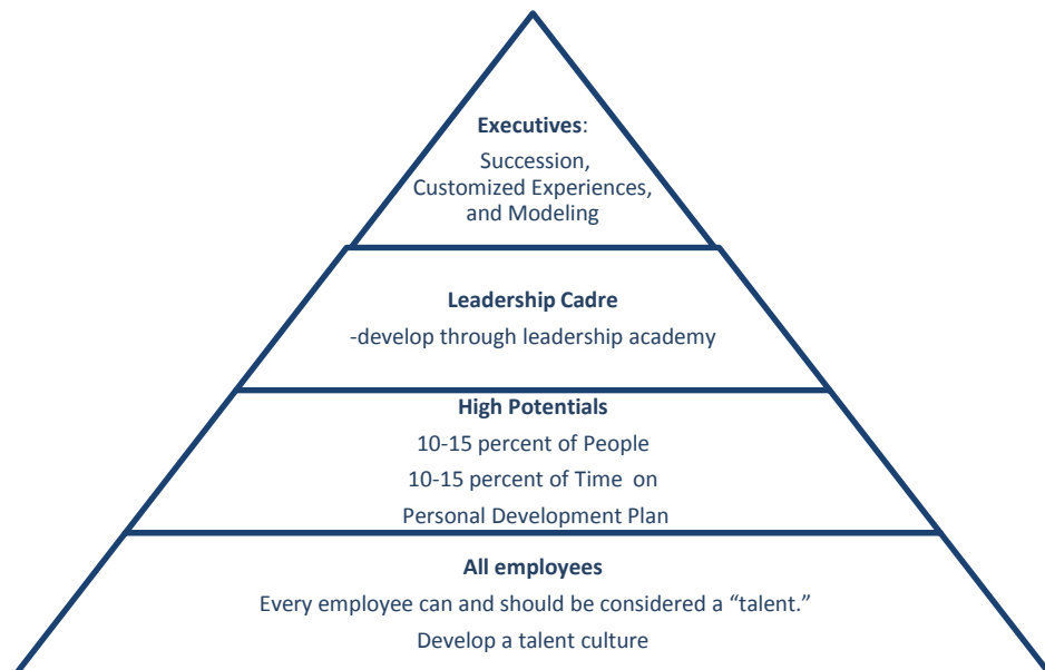
Figure 2 What is Talent? (After Ulrich and Smallwood 2011)

What becomes clear from this discussion is that there is no one 'correct' definition of talent that can be applied to all organisations. A growing opinion is that the diverse nature of the modern workforce means that the choice between either inclusive or exclusive, as extremes on a talent continuum looks