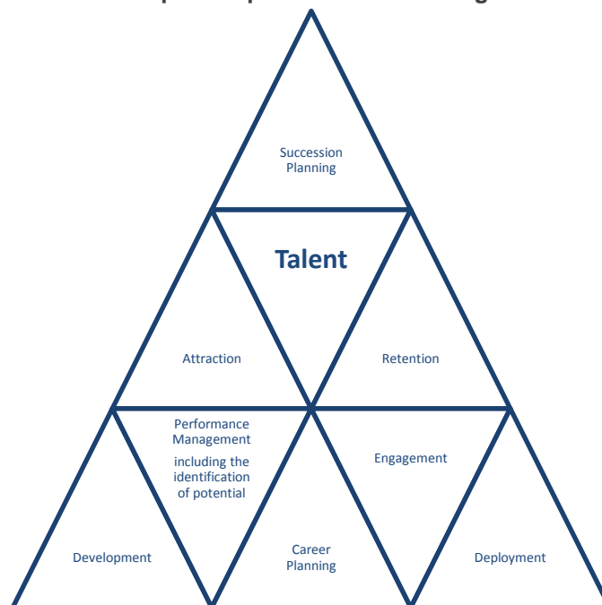
Figure 3 The component parts of talent management

A more inclusive definition of talent management ie a whole workforce approach brings with it additional considerations. Amongst these are the necessary tools to facilitate talent processes to ensure that all individuals have the opportunity to maximise their potential. These include regular conversations between members of the workforce and managers; mentoring or performance coaching; and skills and knowledge development for future roles