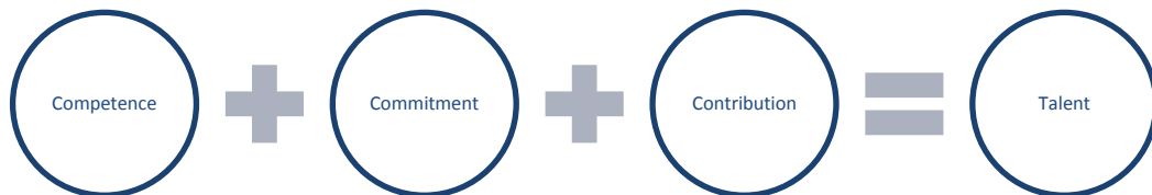
Figure 1 The Talent Formula (After Ulrich 2011)

In both of these definitions, talent is characterised by the skills and contribution of an individual and how they relate to the achievement of the organisation's objectives. Whilst these may appear to be a framework within which it will be a straightforward matter to define talent, the reality can be different. The unique experiences of each organisation will also influence how talent is defined.